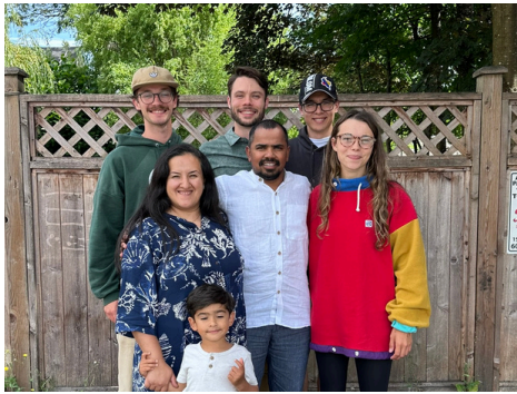
our outreach team