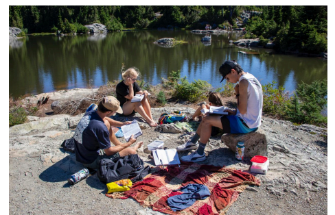
one of our small groups out in nature

Our Discipleship Bible School (DBS) has been running since July. It's a 3-month school, or course, that focuses on teaching people the entire story of God's great redemptive plan as told in the Bible. Each week, we have lectures on the content that we are reading as we go from Genesis to Revelation. As a small group, we highlight and discuss certain points, which will help us to identify and tell the story of God. Last year I took this course as a student, but now I'm staffing it, so I have a fresh perspective on what it's like to be a student in this school. This has really helped me to come alongside the students as I lead the small group (reading time) and grade homework. God has been teaching me so much about the bible and also about teaching it. I love that I am growing in my capability to teach, and it is a skill that I definitely want to improve. During one of the lecture weeks, I had the opportunity to teach on Ecclesiastes. It was a great experience, and I am quite satisfied with how I taught, even though I sprinted through my content as usual. As I am writing this, there are only two more weeks of the course left, and we are preparing for the outreach phase of the school.