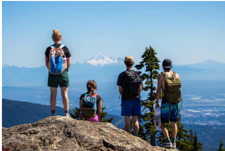
just a super cool picture

Like most schools in YWAM, the DBS is a two-part school. The lecture phase being the first, which I spoke about above. And the Outreach phase is the second. YWAM aims to equip and send people into missions. Our motto is “To Know God and Make Him Known.” So to do that, we run and partner with a number of local outreaches that engage our immediate community here in the city, but also through overseas outreaches, which mobilize people to reach the unreached globally. With the DBS, we will be going on outreach to South/Southeast Asia from October 10 th until November 25 th (I cannot publicly disclose where exactly we are going, but if you would like to know, I can tell you on a more private channel!). We will be going with the intention of teaching the Bible and equipping local believers to also study and teach the Bible. There are not many resources for Bible study or teaching where we are going, so I am excited to provide methods for studying and also to take part in some teaching while we are there.